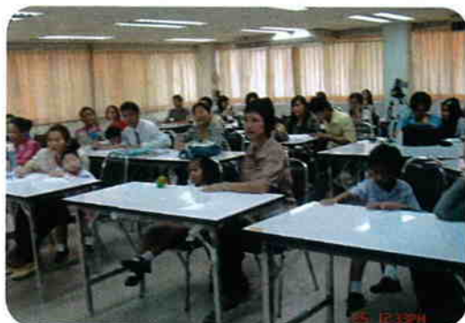
Much to learn how to educate or to reeducate persons with learning difficulties – hoping that what is learned is put into practice at home! Bangkok, Thailand