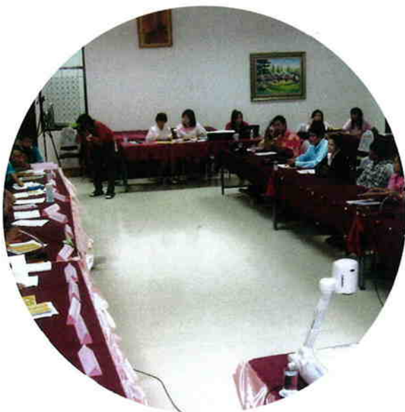
Final session of the Conference For Adults With Learning Difficulties. The only opportunity to have discussion between "Delegates" and "Observers" LopBuri, Thailand