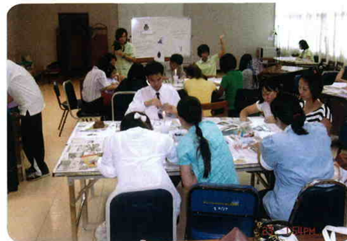
Participants doing their Multisensory / Skills for living assignments - Bangkok, Thailand