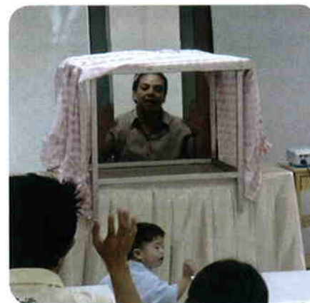
Improvised mass media means is one of the most effective means to teach with and to learn in Special Education. Bangkok, Thailand