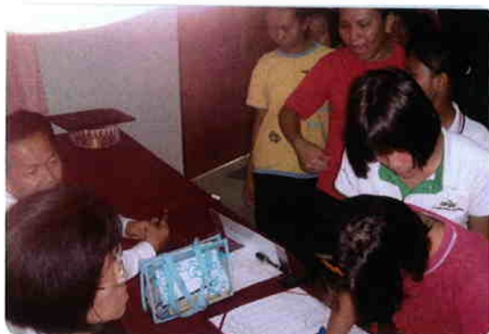
Registration of "Delegates" for the first "conference For Adults With Learning Difficulties" to be held in LopBuri , Thailand. 16 "Delegates" and 34 "Observers" attended. Conference topic was: "I And Work" LopBuri, Thailand