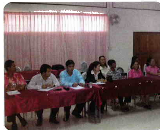
"Observers" parents, teaching people, others facing the "Delegates" for an Open Forum Session on the final day of the Conference For Adult With Learning Difficulties. LopBuri, Thailand