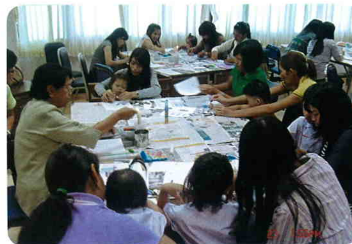
Much work and little play in the basic educational program Bangkok, Thailand