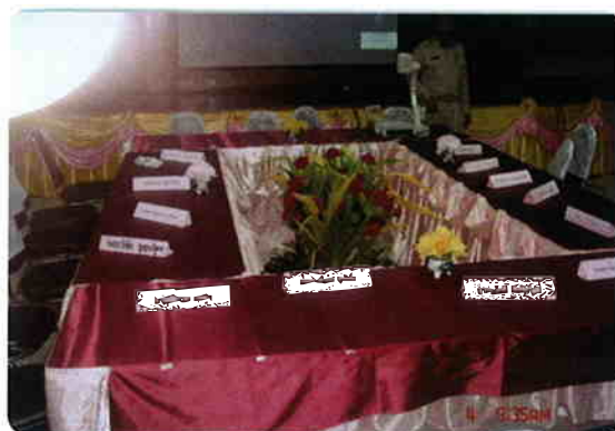
Conference tables prepared for the "Delegates". LopBuri , Thailand