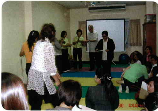
Distribution of Certificates of Achievement for participants (parents teaching people, volunteers) in the course of education for severely disabled people. Bangkok, Thailand