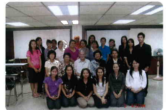
Participants pose for the closing of the Educational Program on advocacy and communications. Bangkok, Thailand