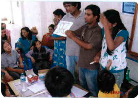
Participants conducting a class on Multisensory skills for living. All participants will have "student" monitoring and class responsibilities in the 40 hours program. Kathmandu, Nepal