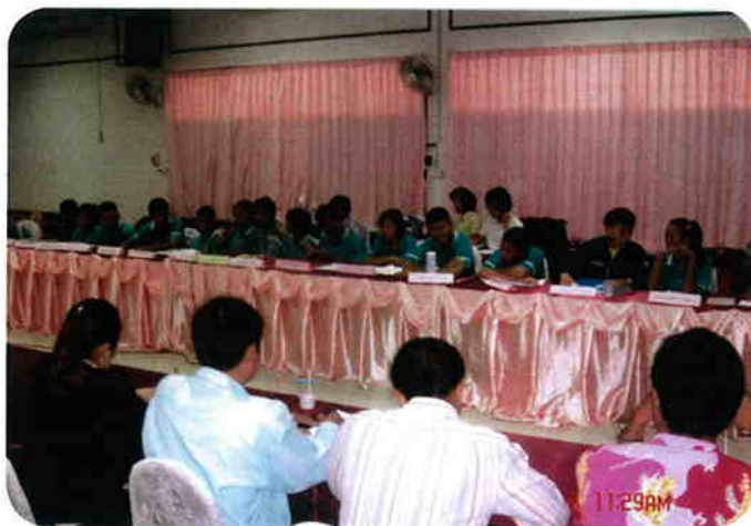
The 16 "Delegates" at the Conference For Adults With Learning Difficulties facing the "Observers" for open discussion at the final Conference sessions. LopBuri, Thailand