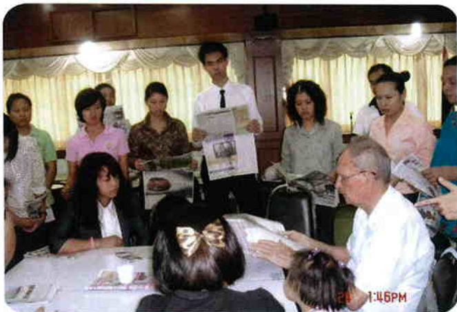
Skills for living (learning how to work) is begun with newspapers. (A no-cost example) Bangkok, Thailand