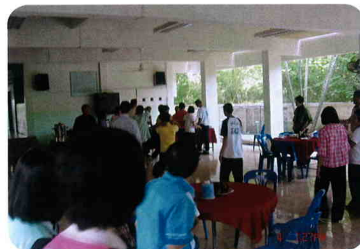
Lunch time (1/2 hour) during the Conference For Adults With Learning Difficulties – LopBuri, Thailand