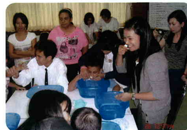
In the basic Special Educational program, there must be teaching that responds to physical needs: cleanliness, oral hygiene, etc.