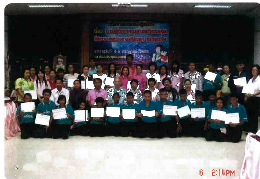
Memorial foto of all "Delegates" and "Observers" who participated in the first Conference For Adults With Learning Difficulties to be held in LopBuri, Thailand