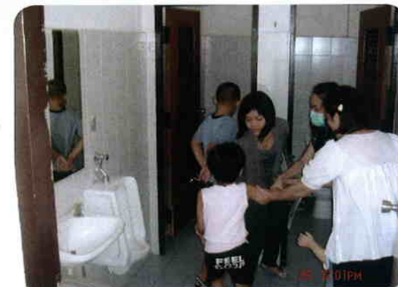
All humans beings must eat, drink, rest and go to the toilet or we will die! – So toiletry must be taught and learned or there will be fatal consequences. Bangkok, Thailand